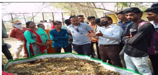
Visit to vermicompost unit of PGIVAS, Akola