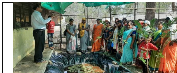
Vist to Azolla unit PGIVAS, Akola